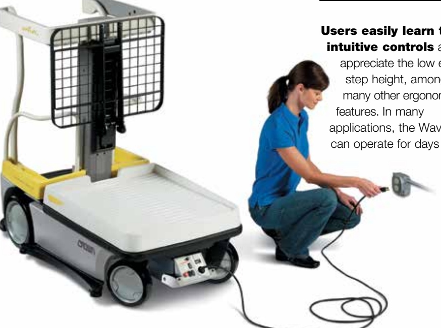
Retractable cord reel

Multiple battery pack options (wet cell/maintenance-free)