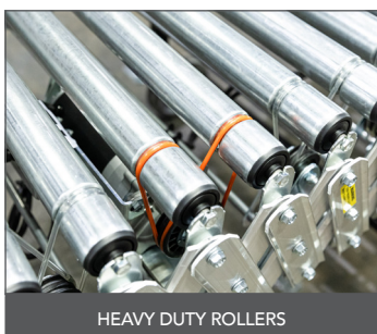
HEAVY DUTY ROLLERS

Technical Support Installation & Setup Service Maintenance Application Support Hardware Support