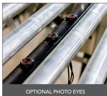
OPTIONAL PHOTO EYES