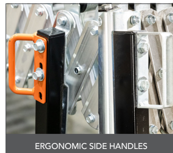
ERGONOMIC SIDE HANDLES

VISIT OUR WEBSITE TO LEARN MORE :: WWW.FMHCONVEYORS.COM