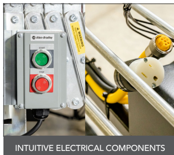
INTUITIVE ELECTRICAL COMPONENTS