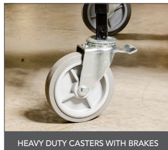
HEAVY DUTY CASTERS WITH BRAKES