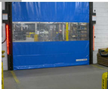
Optional Virtual Vision