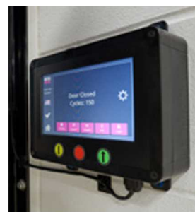
Graphic User Interface (GUI)