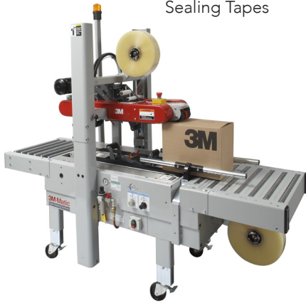
3M-Matic™ Case Sealer 700r