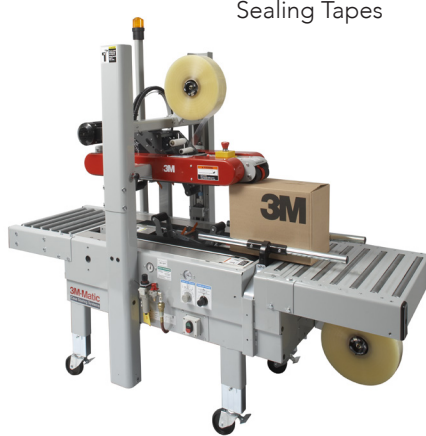
3M-Matic™ Case Sealer 700r3